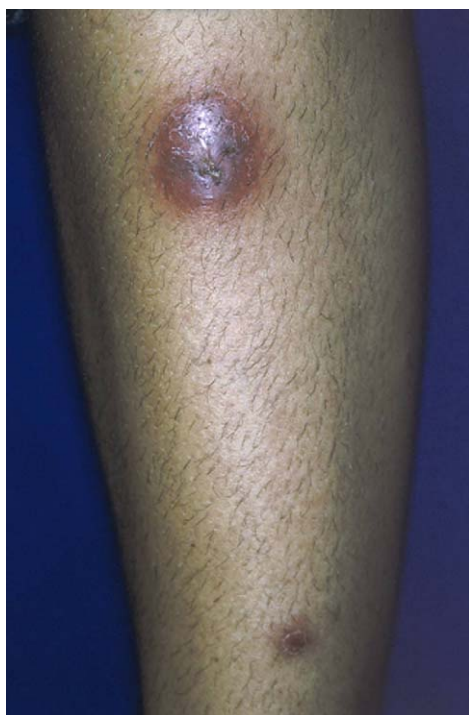
Fig 1. Case 1. Nodules on shin with crusting and peripheral erythema.

chlorhexidine cleanser and mupirocin ointment. A bacterial culture was performed and reported as negative. The patient's condition continued to flare despite treatment. Consequently, a 3-mm punch biopsy specimen was obtained and the resultant copious purulent material was sent for culture. The biopsy finding was most consistent with furunculosis with a neutrophilic and granulomatous infiltrate clustered around hair follicles (Fig 2). Bacterial culture of the purulent material was again negative. The patient continued to worsen with the appearance of new violaceous nodules. Two additional 3-mm punch biopsy specimens were obtained, one for histopathology and one for culture for atypical microbacteria and fungal and anaerobic organisms. The repeat biopsy finding was consistent with a furuncle or carbuncle with negative periodic acid-Schiff and acid-fast bacilli (AFB) stains. After 1 month, the AFB cultures were found to be positive for M fortuitum/peregrinum group. The patient was started on a regimen of clarithromycin, 500 mg twice daily, and rifampin, 300 mg once daily. When sensitivities became available showing intermediate susceptibility to clarithromycin, the patient's regimen was switched from clarithromycin to doxycycline, 100 mg twice daily for a 6-week course. Upon follow-up, the patient had improved but still complained of purple-brown discoloration and scarring at the sites of the previous lesions (Fig 3).