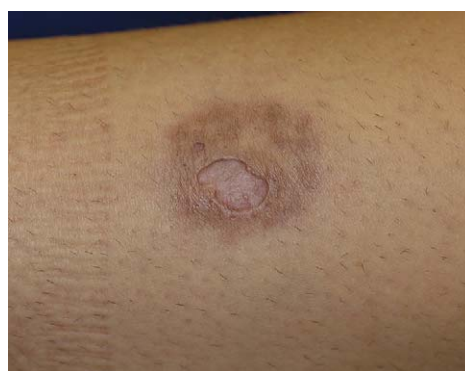
Fig 3. Case 1. Discoloration and scarring at the sites of a previously active furuncle after completion of double antibiotic therapy.