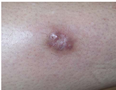
Fig 4. Case 3. Follow-up examination showed some improvement with residual scarring at sites of previous lesions.

daily, and trimethoprim-sulfamethoxazole DS twice daily. The AFB culture was positive for M chelonae/fortuitum and was not further classified; sensitivities were not obtained to guide therapy. The patient could not tolerate the twice-daily dosing of the medications because of gastrointestinal side effects and was switched to once-daily dosing. She improved but continued to complain of draining abscesses, which all resulted in hypopigmented to violaceous scars. Antibiotic therapy was continued until all the lesions were healed, a total of 5 months.